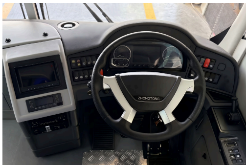
Integrated Safety Hub