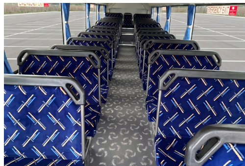
Flexible Seating Capacity